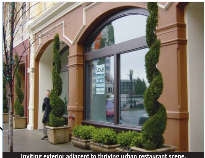
Inviting exterior adjacent to thriving urban restaurant scene.

SITE | Located in the historic Grand Stable & Carriage building, this space has large glass storefronts facing SW 2nd Avenue and is visible to westbound traffic on the Morrison Bridge, entering downtown Portland. Strong daytime employment and lively evening scene. Area retailers include Mother's Bistro & Bar, Nordstrom Rack, Al Amir, Huber's, McCormick & Schmick's, Kell's Irish Pub, Mama Mia's, Attic Gallery, Pacific Office Furnishings and 2nd Avenue Records. Ideal space for gallery, bar or user with need for combined office/retail space.