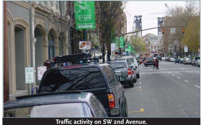
Traffic activity on SW 2nd Avenue.

SITE | Located in the historic Grand Stable & Carriage building, this space has large glass storefronts facing SW 2nd Avenue and is visible to westbound traffic on the Morrison Bridge, entering downtown Portland. Strong daytime employment and lively evening scene. Area retailers include Mother's Bistro & Bar, Nordstrom Rack, Al Amir, Huber's, McCormick & Schmick's, Kell's Irish Pub, Mama Mia's, Attic Gallery, Pacific Office Furnishings and 2nd Avenue Records. Ideal space for gallery, bar or user with need for combined office/retail space.