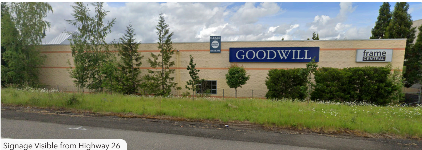
Signage Visible from Highway 26