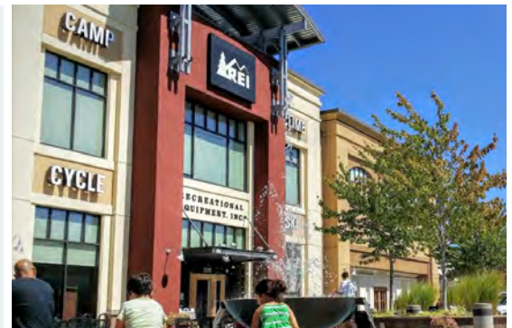
THE STREETS OF TANASBOURNE