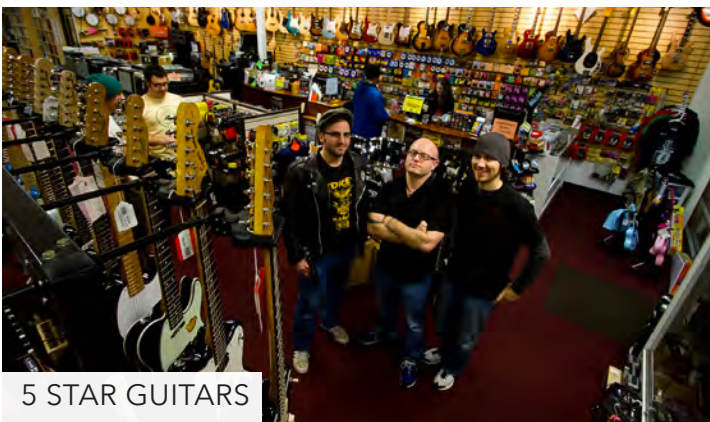
5 STAR GUITARS