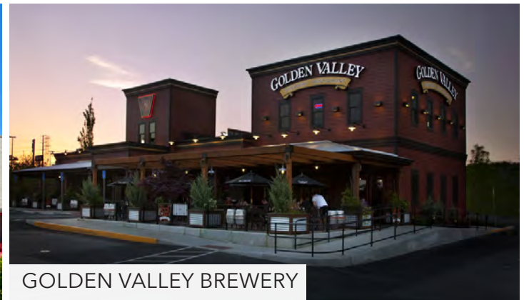
GOLDEN VALLEY BREWERY