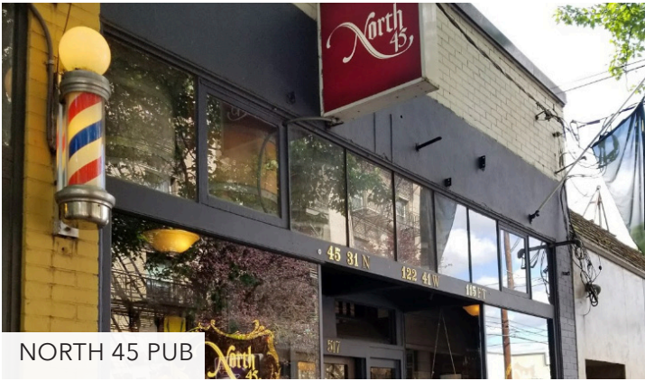
NORTH 45 PUB