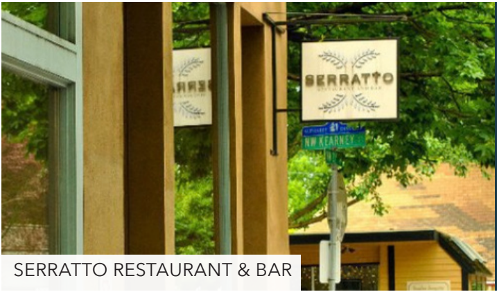
SERRATTO RESTAURANT & BAR