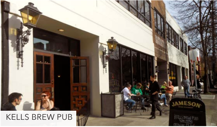
KELLS BREW PUB