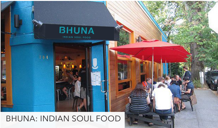
BHUNA: INDIAN SOUL FOOD