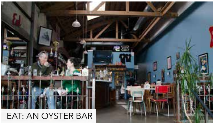
EAT: AN OYSTER BAR