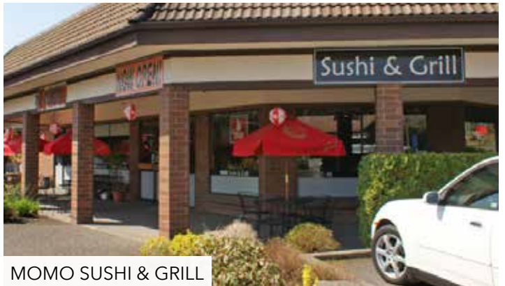
MOMO SUSHI & GRILL