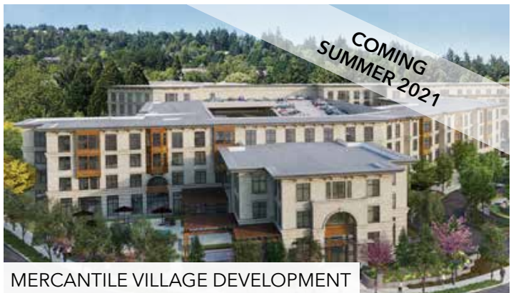
MERCANTILE VILLAGE DEVELOPMENT