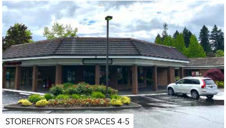
STOREFRONTS FOR SPACES 4-5