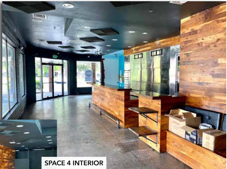
SPACE 4 INTERIOR