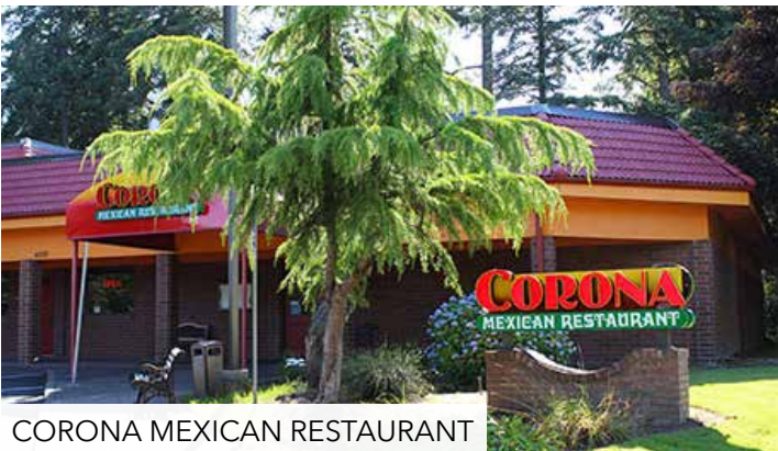
CORONA MEXICAN RESTAURANT