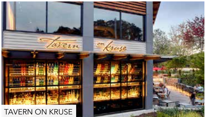
TAVERN ON KRUSE