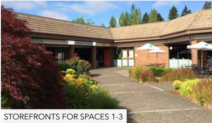
STOREFRONTS FOR SPACES 1-3