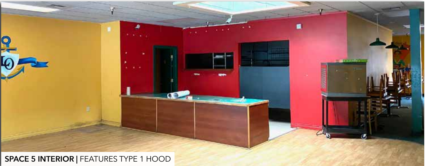
SPACE 5 INTERIOR | FEATURES TYPE 1 HOOD