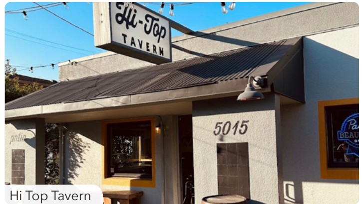
Hi Top Tavern