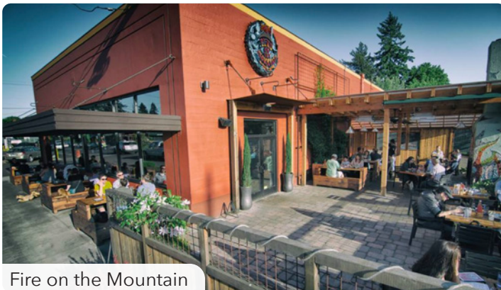
Fire on the Mountain