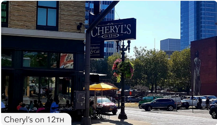
Cheryll's on 12th