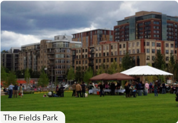
The Fields Park