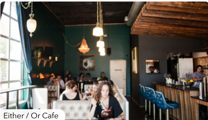
Either / Or Cafe