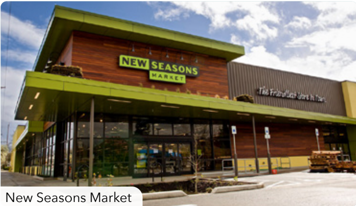
New Seasons Market