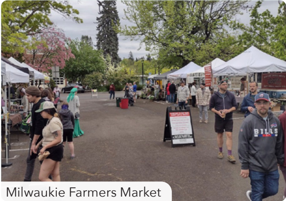
Milwaukie Farmers Market