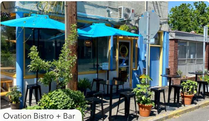
Ovation Bistro + Bar