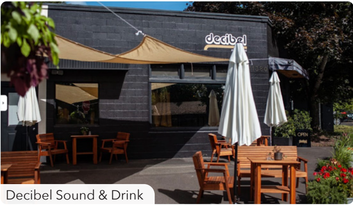
Decibel Sound & Drink