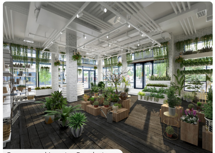
Conceptual Interior Renderings

The ground floor spaces are ideal for retail or service retail and offer available vent shafts for restaurant opportunities. Each corner space offers modern design elements with clean lines, large glass storefront systems, double glass storefront entries and high ceilings. Axletree is a great opportunity to serve downtown Milwaukie's growing population. Existing neighborhood retailers and restaurants include: Bloom Garden Supply, Duffy's Irish Pub, Bank of the West, Milwaukie Farmer's Market and more.