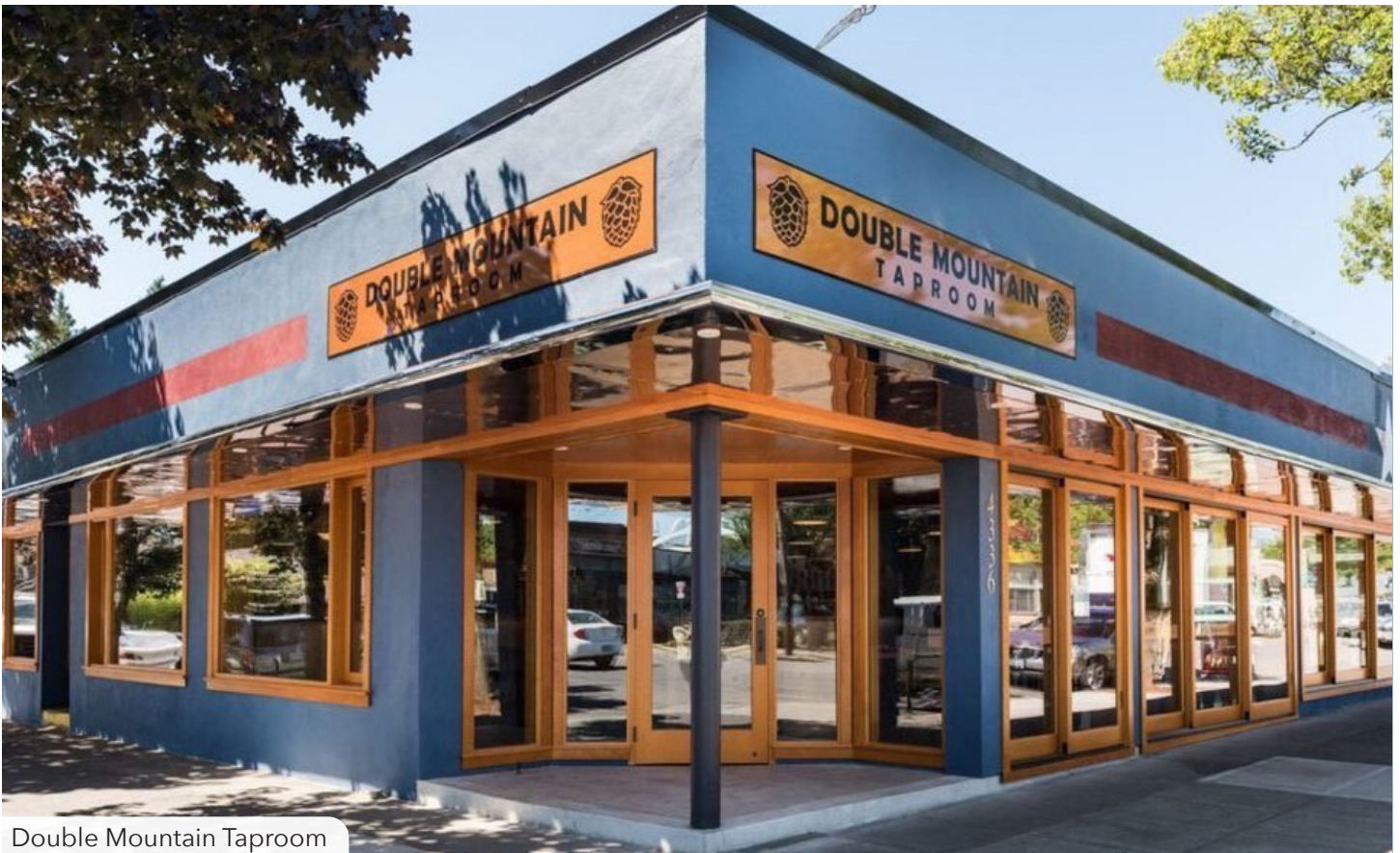
Double Mountain Taproom