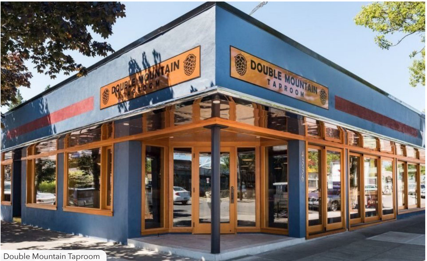
Double Mountain Taproom