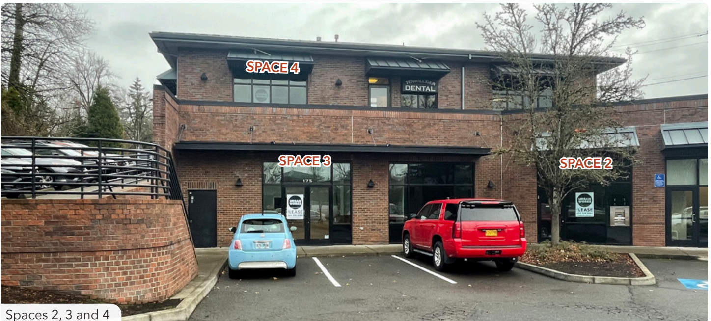
Spaces 2, 3 and 4

Retail / Restaurant / Cafe / Salon / Office