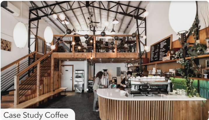
Case Study Coffee