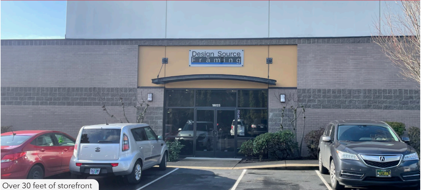
Over 30 feet of storefront