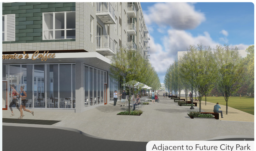
Adjacent to Future City Park

Slabtown Square will be an activated campus, fostering unity and connection between retail and residential spaces. Diverse retail floorplans offer access to NW 21st Avenue, NW Quimby Street, and NW Pettygrove Street, as well as options to open into the public courtyard or the activated residential lobby. The fluidity of space and amenities will result in a lively and spirited community environment in the heart of Slabtown.