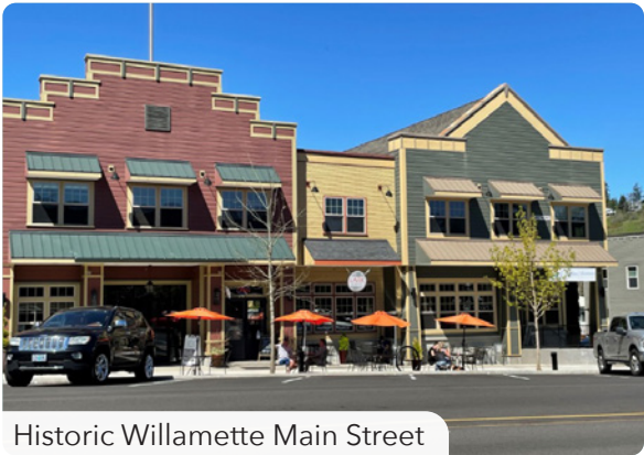
Historic Willamette Main Street