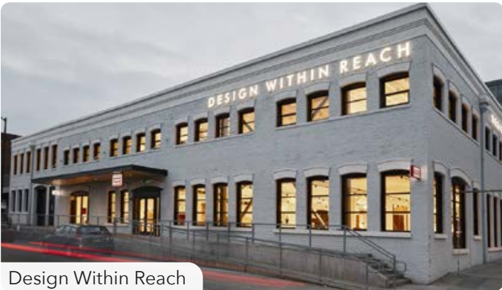
Design Within Reach