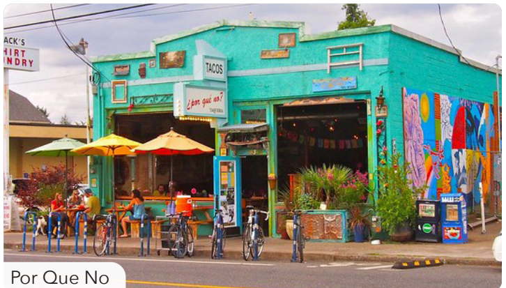
Por Que No