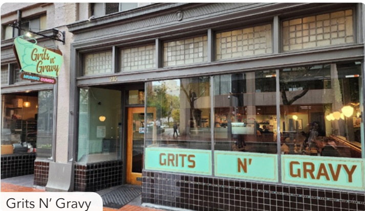
Grits N' Gravy