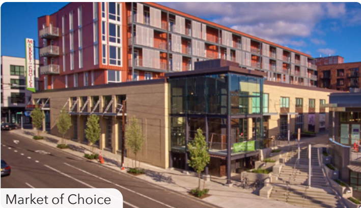
Market of Choice