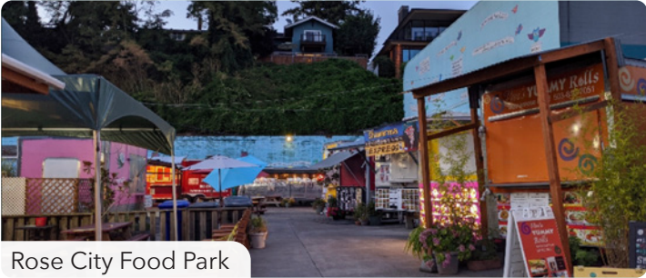
Rose City Food Park