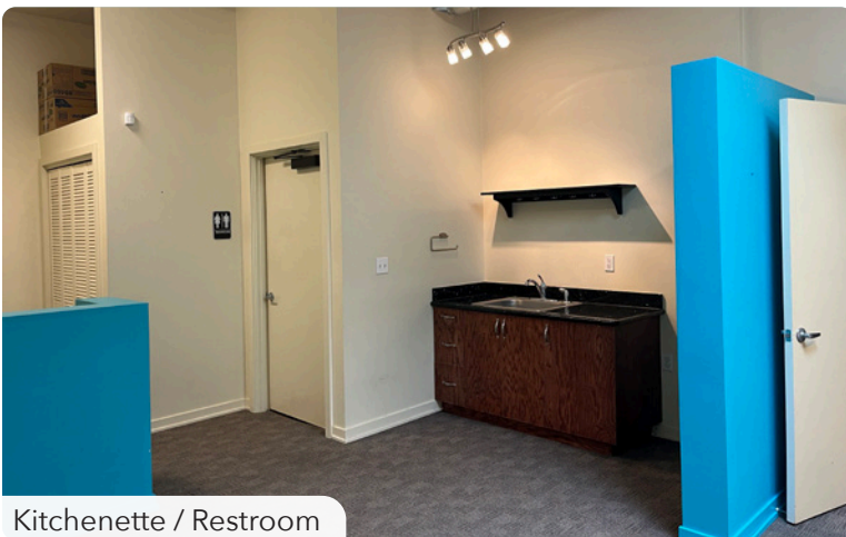
Kitchenette / Restroom