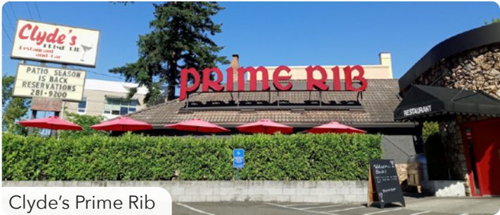
Clyde's Prime Rib