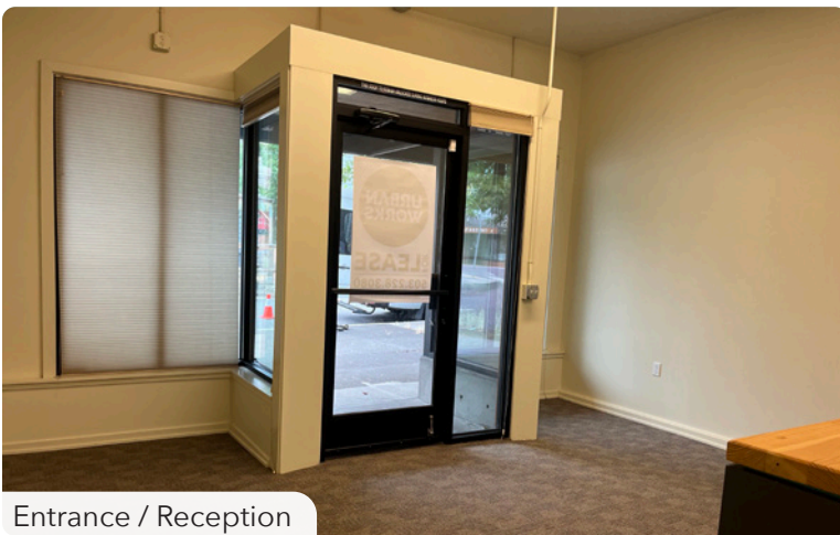
Entrance / Reception