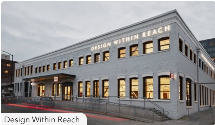
Design Within Reach