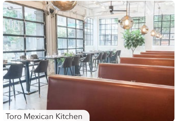
Toro Mexican Kitchen