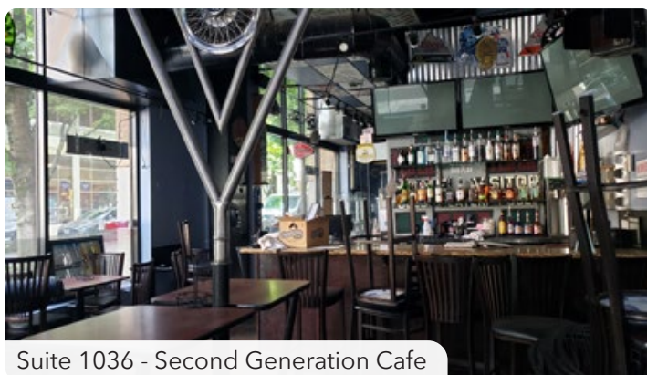
Suite 1036 - Second Generation Cafe