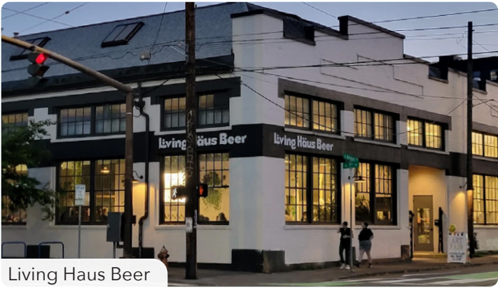
Living Haus Beer