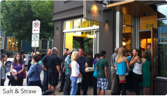
Salt & Straw