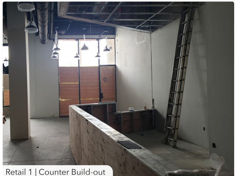
Retail 1 | Counter Build-out