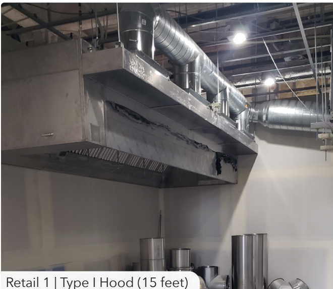
Retail 1 | Type I Hood (15 feet)

Three ground floor suites located along NW 23rd Ave, each featuring full height operable windows that open up to the vibrant neighborhood for an indoor/outdoor experience.