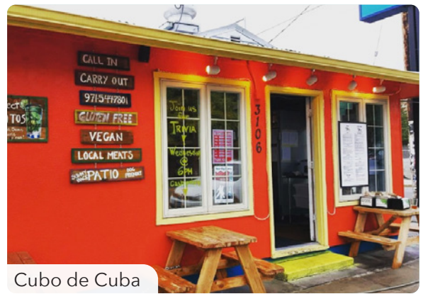
Cubo de Cuba

Inner Southeast Portland is one of the most desirable destinations for residents and patrons across the metro area. With New Seasons at SE Division and 20th, this area features a thriving mix of restaurant, café, retail and service businesses. With its close-in proximity to downtown Portland and established residential neighborhoods, commercial retail spaces are always in demand in this popular commercial district. The rare retail turnover occurs with little-to-no time on market.