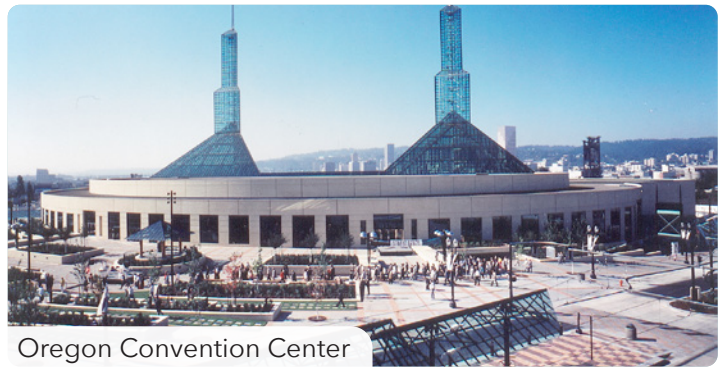
Oregon Convention Center