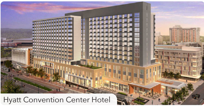
Hyatt Convention Center Hotel