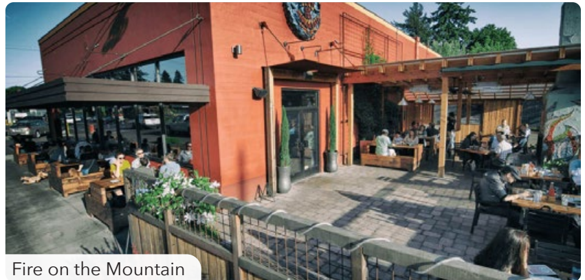
Fire on the Mountain