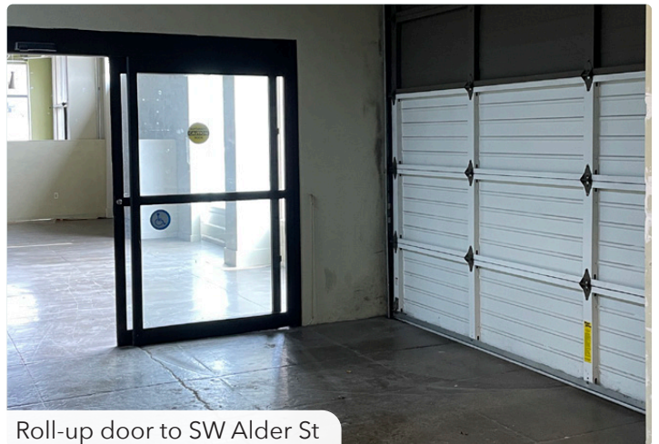
Roll-up door to SW Alder St