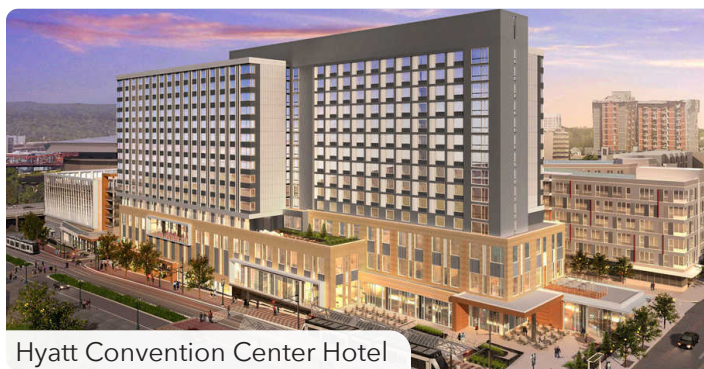
Hyatt Convention Center Hotel