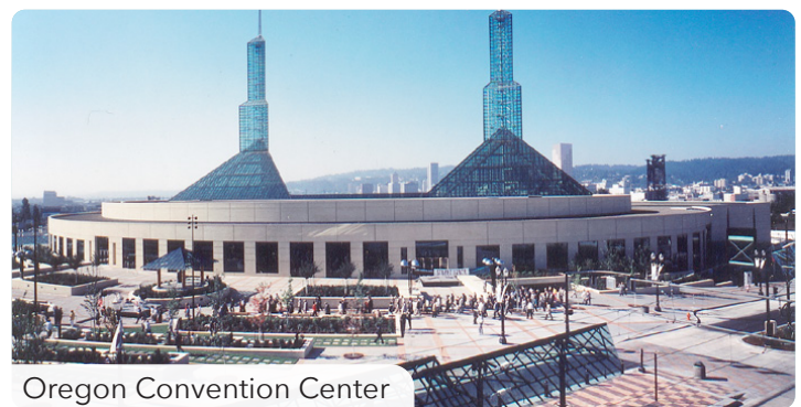
Oregon Convention Center