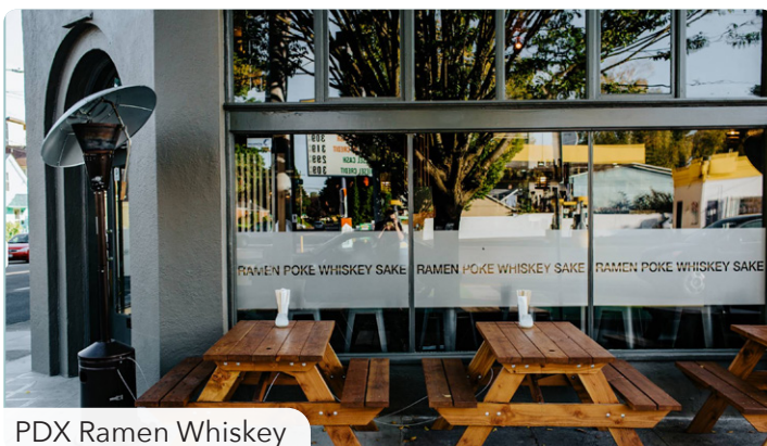
PDX Ramen Whiskey