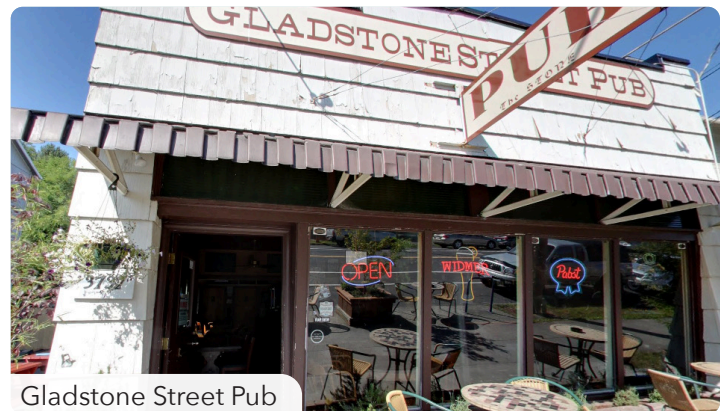
Gladstone Street Pub