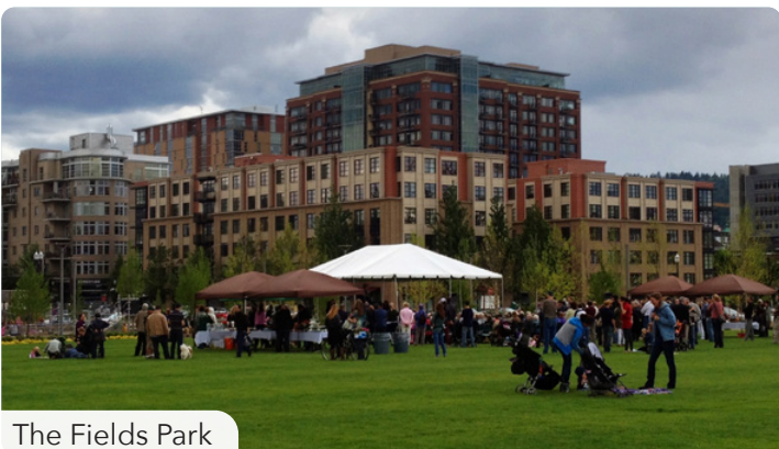
The Fields Park