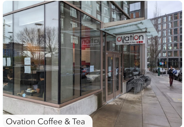
Ovation Coffee & Tea