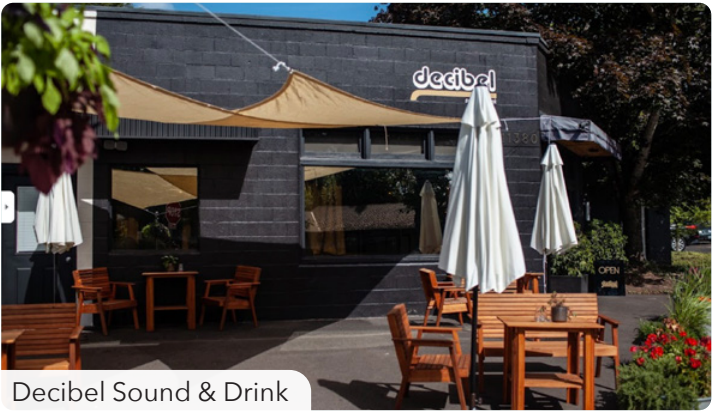
Decibel Sound & Drink