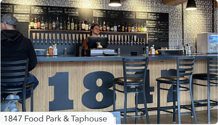
1847 Food Park & Taphouse