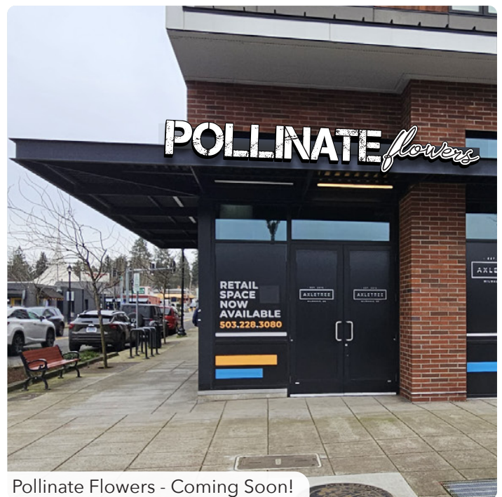
Pollinate Flowers - Coming Soon!

Existing neighborhood retailers and restaurants include: pFriem Brewery, Bloom Garden Supply, Duffy's Irish Pub, Milwaukie Farmer's Market and more.