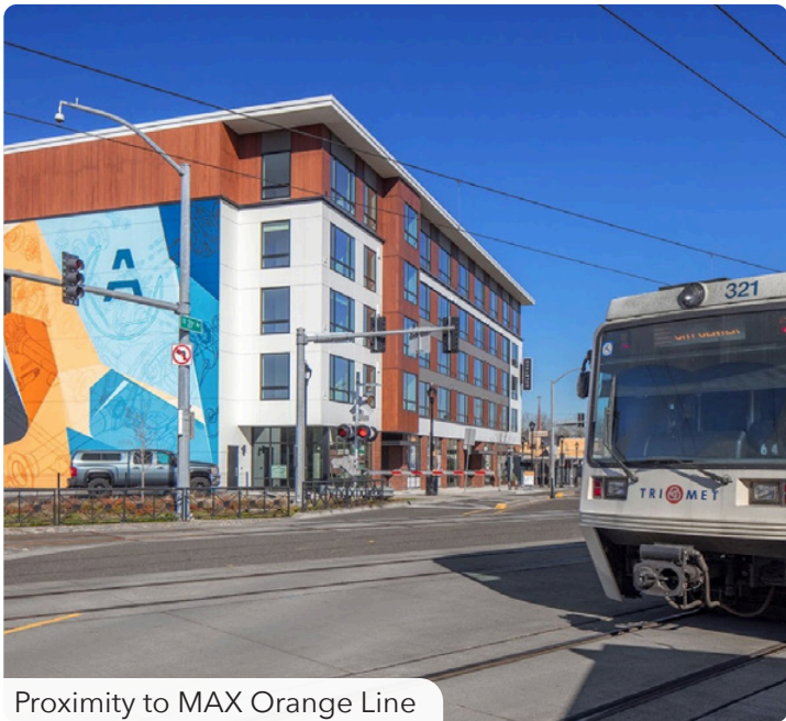
Proximity to MAX Orange Line