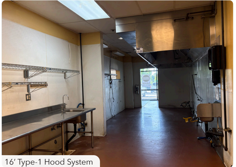
16' Type-1 Hood System