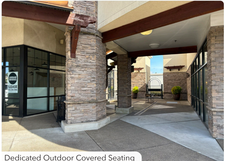
Dedicated Outdoor Covered Seating