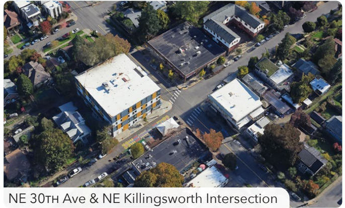
NE 30TH Ave & NE Killingsworth Intersection